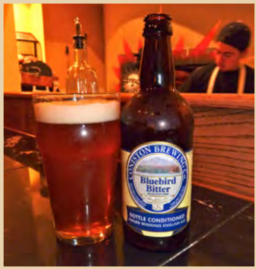
▲ Fancy a Bluebird Bitter English Ale?